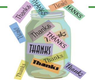
Overflowing With Thanks