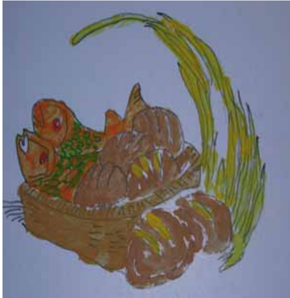
(This art was done by one of our teenage youth in the Tower room)